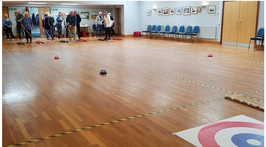
Walking Group and Kurling Group